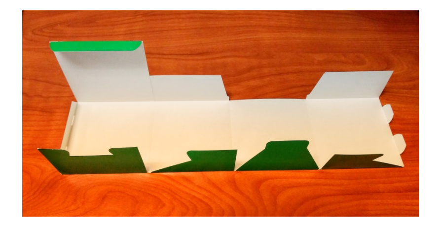
Turn each side and the tabs of the box upward where perforated.