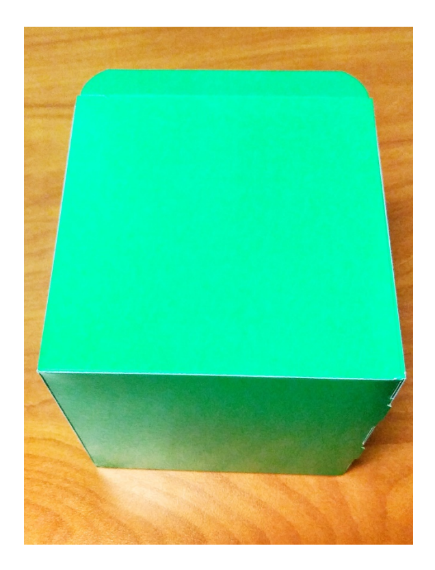
Turn the box bottom side down. Fold the top tab in to secure the top.